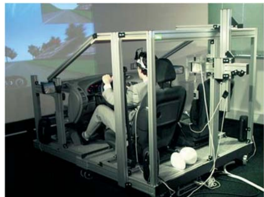
Vehicle driver attention simulator